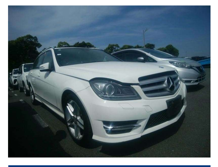
Purchase Price Includes GST, Registration & Licensing

Finance may be available on this vehicle. Ask one of our friendly staff for more information.