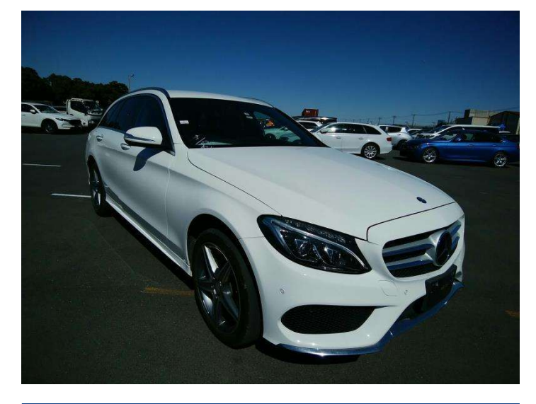
Purchase Price Includes GST, Registration & Licensing

Finance may be available on this vehicle. Ask one of our friendly staff for more information.