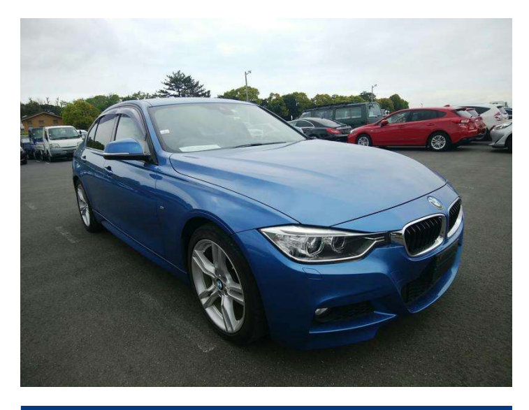
Purchase Price Includes GST, Registration & Licensing

Finance may be available on this vehicle. Ask one of our friendly staff for more information.